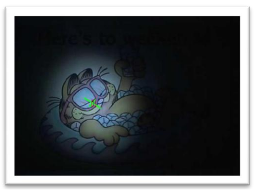
Figure 5: Inclination of the Light Source