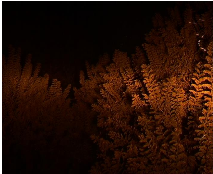
Figure: 2 Composite Image (The insect movement produced artifacts at right top corner, which can be eliminated by detecting them)