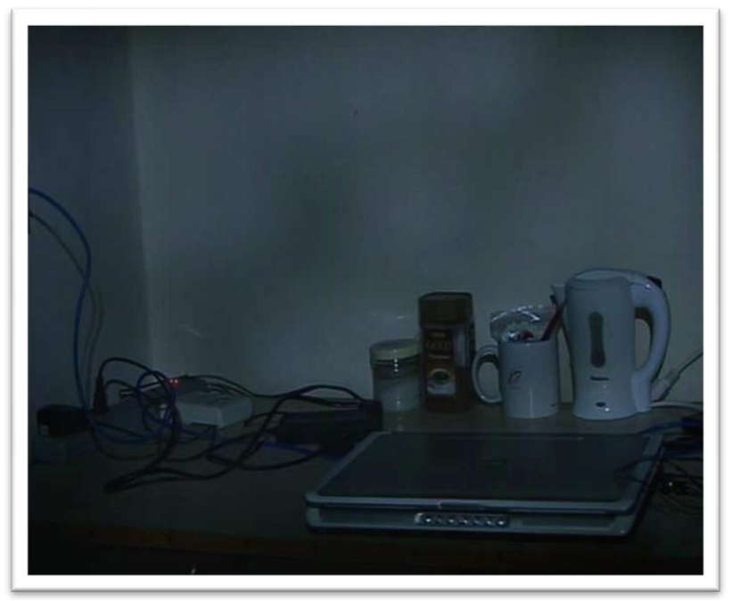
Figure 7: Composite Image (The cable shadow shows artifacts which can be eliminated using scene information)