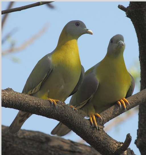
Local Migrant: Yellow-footed Green Pigeon