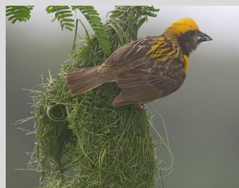
Breeding Migrant: Baya Weaver