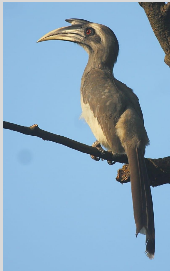
Resident: Indian Grey Hornbill