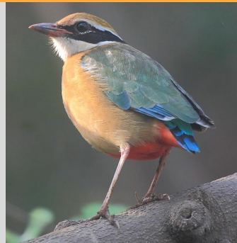
Passage Migrant: Indian Pitta